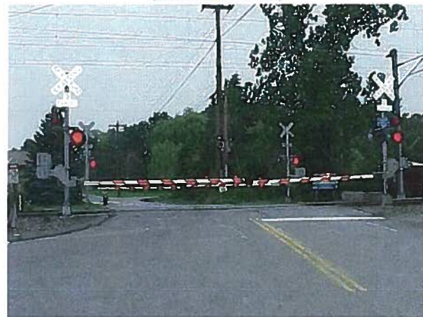
EXAMPLES OF QUAD GATES